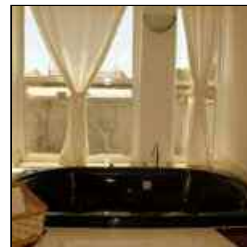
th penthouse 1253263256