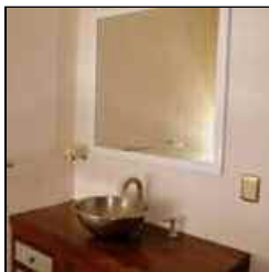
th penthouse 1253263278