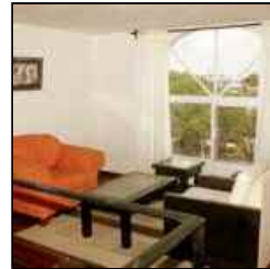
th penthouse 1253263214