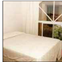
th penthouse 1253263184