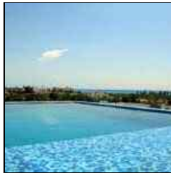
th penthouse 1253263175