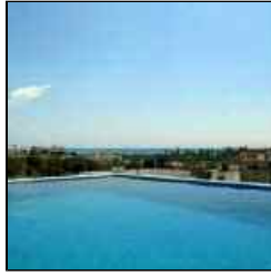
th penthouse 1253263163