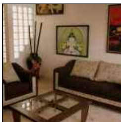
th penthouse 1253263320