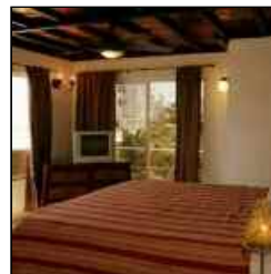
th penthouse 1253263298