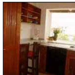
th penthouse 1253263381