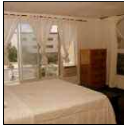
th penthouse 1253263204