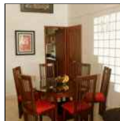
th penthouse 1253263331