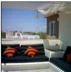
th penthouse 1158668866