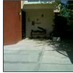
Entry b1 th otherproperties 1165540297