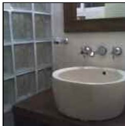
th penthouse 1158668668