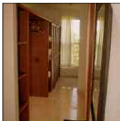
th penthouse 1253263268