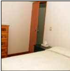
th penthouse 1253263194