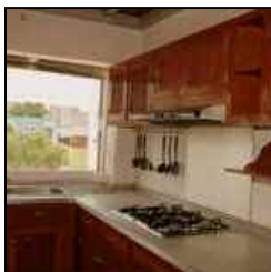
th penthouse 1253263371