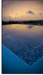
Sunrise over pool