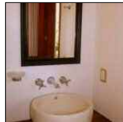
th penthouse 1253263246