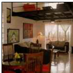
th penthouse 1253263341