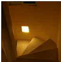
th penthouse 1158668724