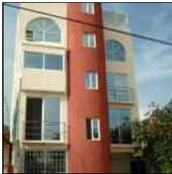
th otherproperties 1189898432