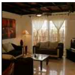
th penthouse 1253263308